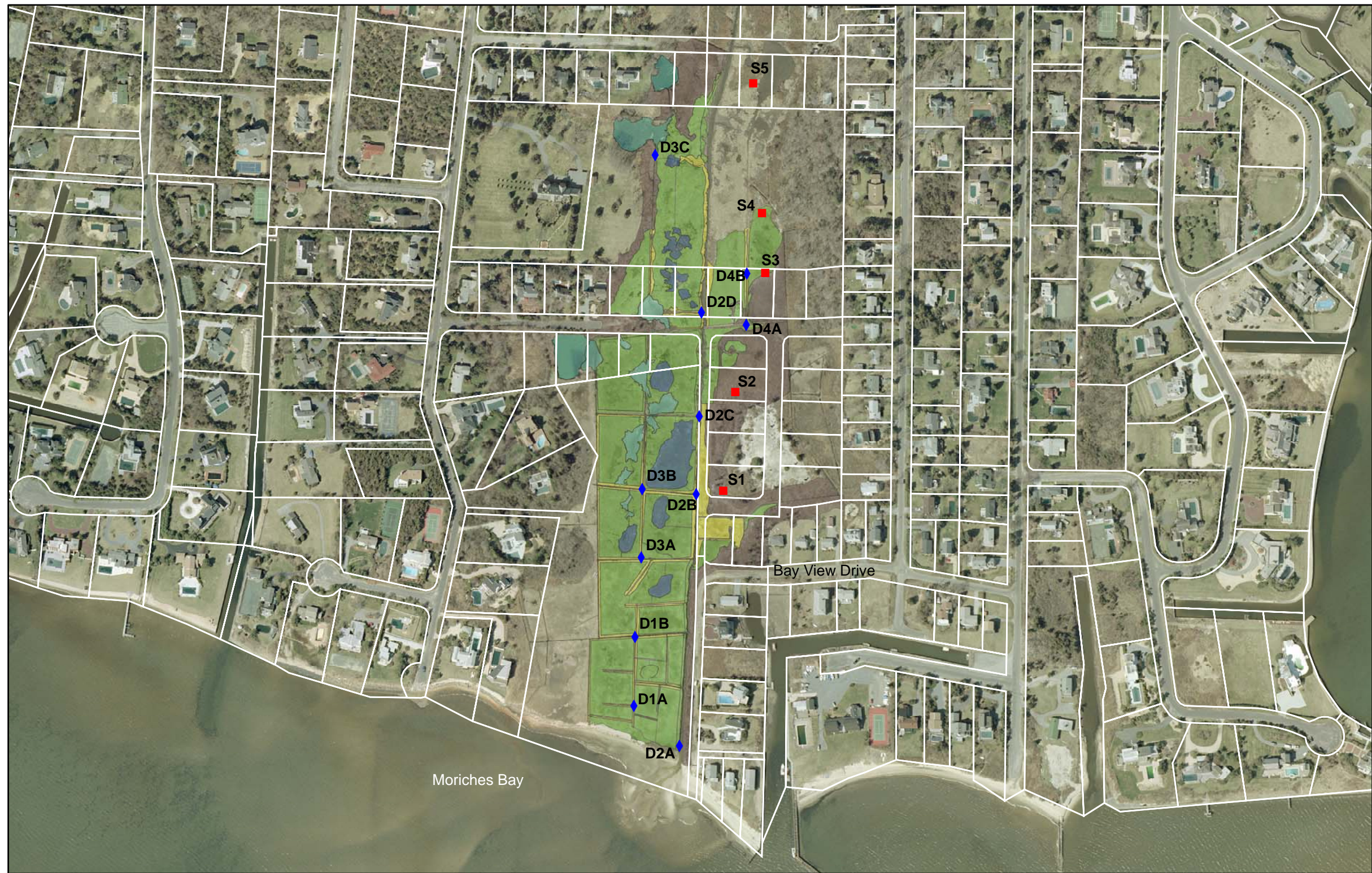
Source: Aerial Map obtained from NYS High Resolution Digital Orthoimagery Program - Suffolk County dated 2001

Prepared for: Suffolk County Department of Public Works